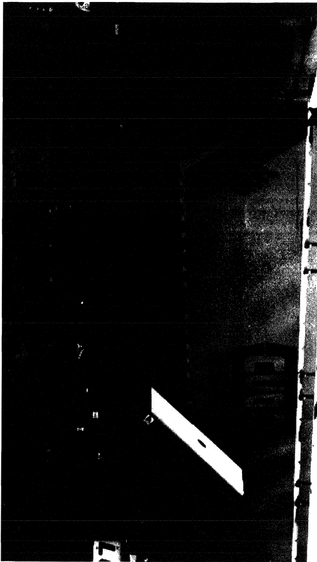
EXHIBIT 1 tabbler